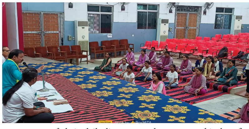
The program kicked off with a yoga a part of their daily lives. more about yoga and its benefits. well-being among the university's

encouraged everyone to make ation for the opportunity to learn